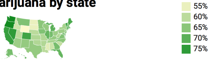
• Source: Civiq • Embed • Created with Datawrapper